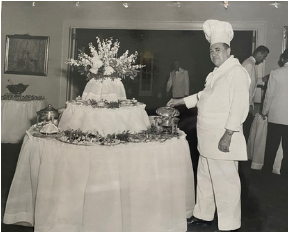
The Western Am banquet in our clubhouse

The Western Golf Association (WGA) hosted a cocktail party and supper buffet during the tournament, on Thursday evening after the round-of-32 Thursday matches. The guest list included WGA officials, Blythefield members working at the tournament, members of the press covering the tournament, and the 16 contestants still in the tournament. It appears from these photos that this dinner was an all-male event.