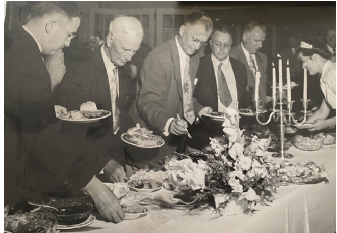
Note the lavish spread, the candelabra, and a member of our waitstaff.